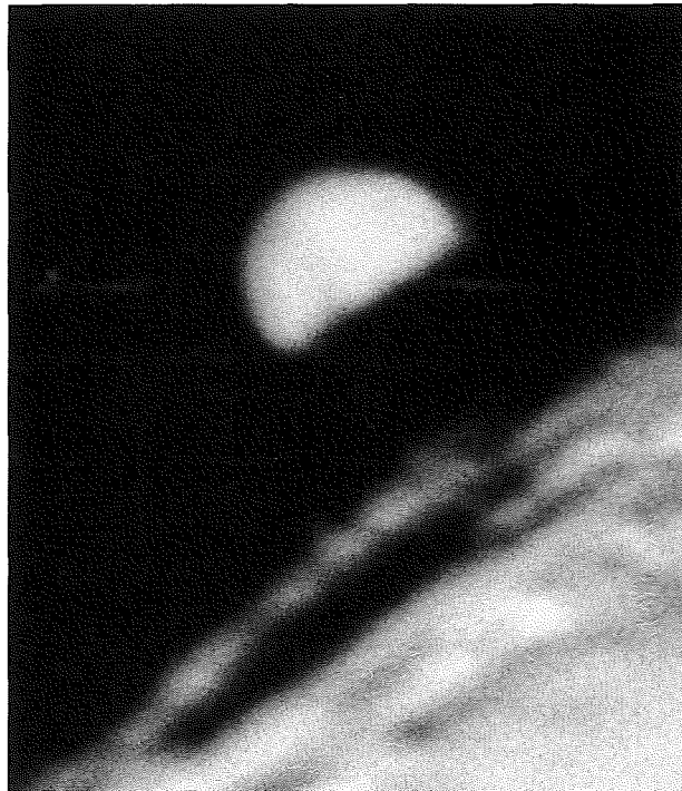
Figure 2 . Photograph of the lunar occultation of Mars taken at the same instant as Figure 1.